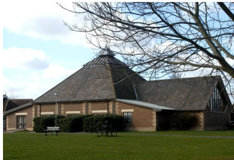
Church of St Michael and All Angels