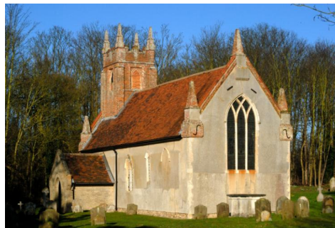
Church of St John the Baptist