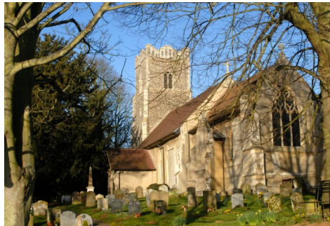
Church of St Mary the Virgin